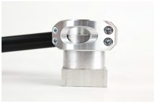
fork leg engagement). (Clamp doesn't have 100% fork leg engagement).