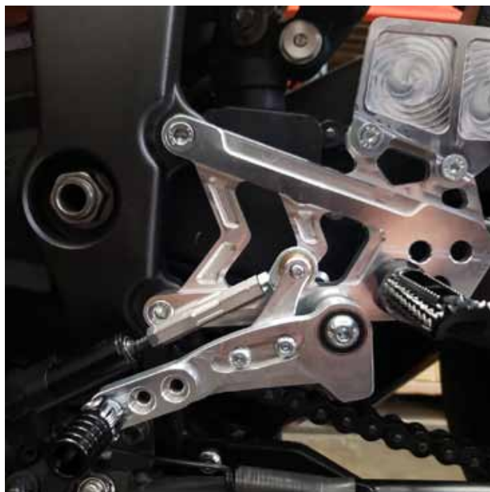
Shift side reverse shift