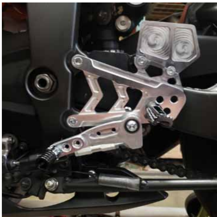
Shift side standard shift