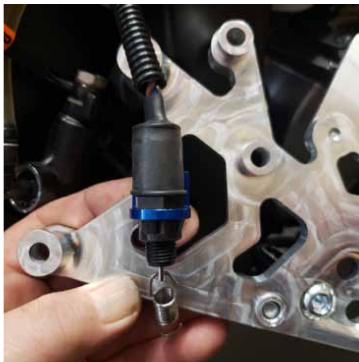
Brake side back side

THIS PRODUCT IS INTENDED TO BE INSTALLED BY A CERTIFIED TECHNICIAN*