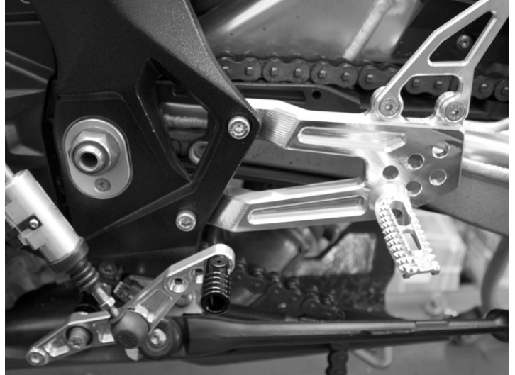
(Fig 2.) Standard Shift