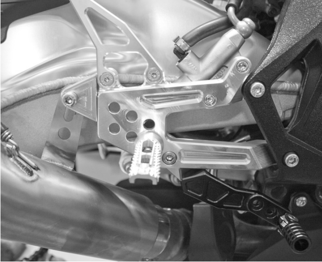
(Fig 1.) Brake