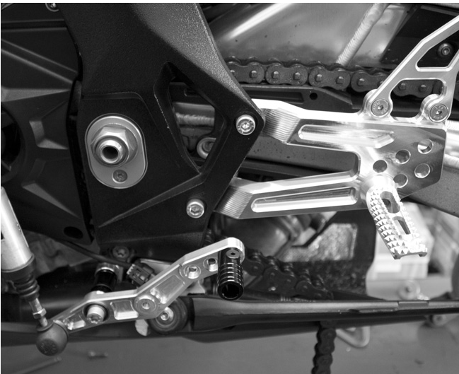
(Fig 3.) Reverse Shift

THIS PRODUCT IS INTENDED TO BE INSTALLED BY A CERTIFIED TECHNICIAN*