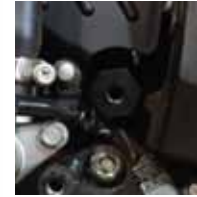
Fig. 2 (shifter standoff)