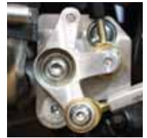
Fig. 5 (reverse shift)