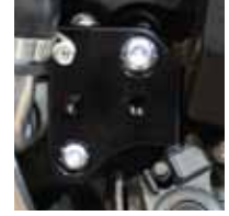
Fig. 3 (bellcrank plate)