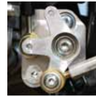
Fig. 4 (standard shift)