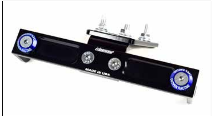
SHOWN WITHOUT TURN SIGNALS