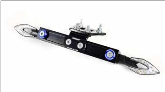
SHOWN WITH TURN SIGNALS